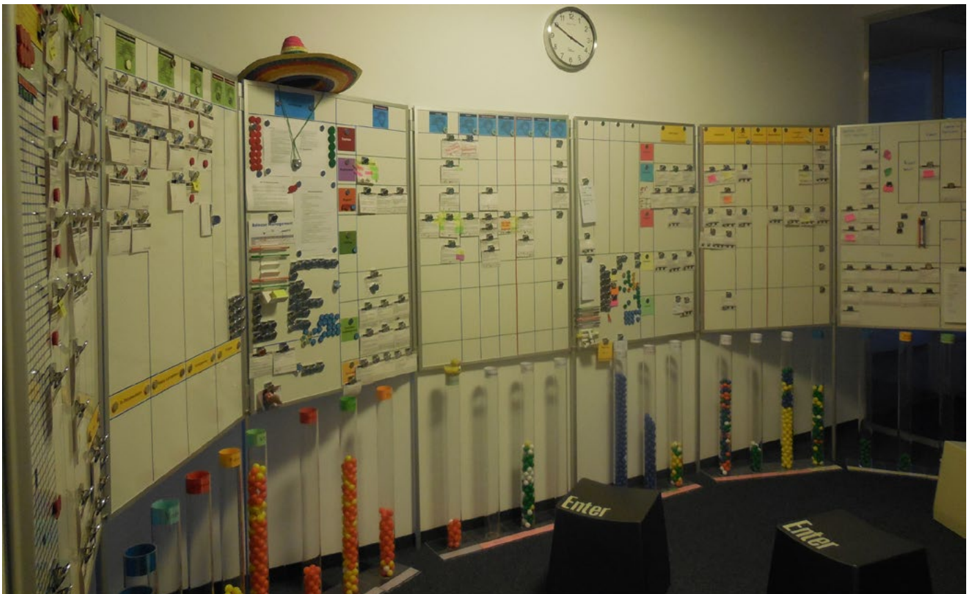
Figure 1 - The Kanbanraum

The need for software systems to operate such a complex market was evident. Visotech just happened to be at the right place in the right time. Its product Periotheus had been designed with the goal to communicate, organise and visualise all the data exchanges happening on a daily basis in the energy value chain,