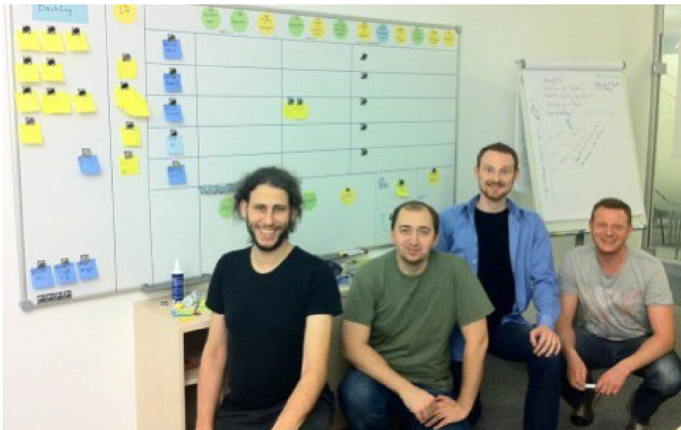
Figure 2 - The first ever Kanban board.

Next they moved onto designing a kanban system for