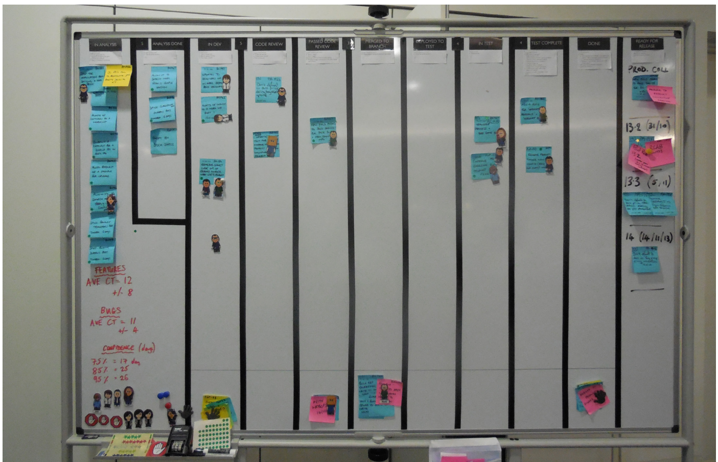
Figure 4 - The Kanban board of the team as of October 2013.

“We knew approximately how long something would take, and we also saw just how approximate that picture was because there was massive variation in tasks that supposedly were the same size. We could finally see and address that,” David says.