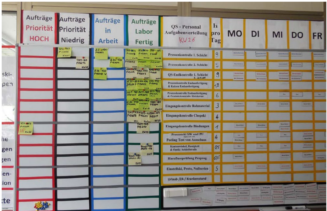
This Kanban board keeps track of the quality tests for various pairs of skis. Inspired by IT’s Kanban board, it is one of the latest improvements on the manufacturing floor.