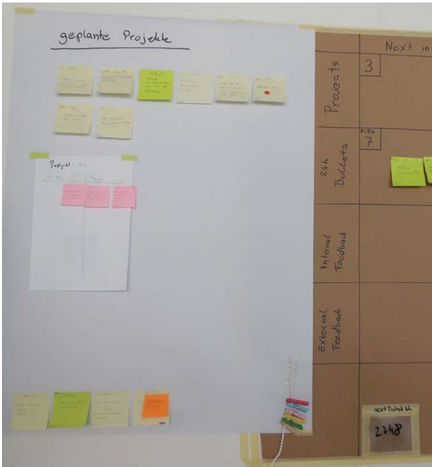
Backlog for tickets related to planned projects.